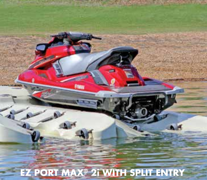
EZ PORT MAX® 2i WITH SPLIT ENTRY