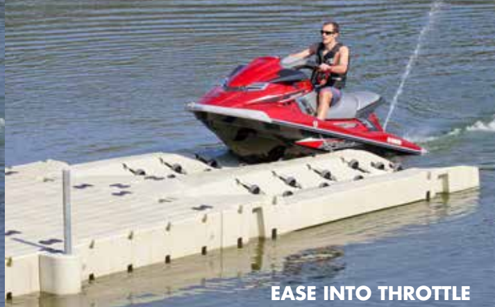
EASE INTO THROTTLE