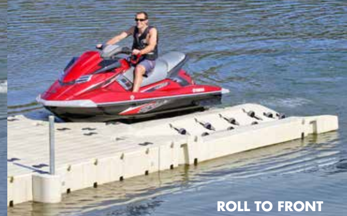
ROLL TO FRONT